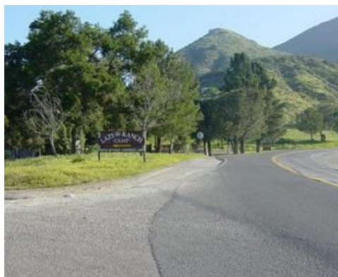
Road sign as seen traveling EAST on Hwy 74, from Interstate 5

From the South, a detour option is the Camino Capistrano exit. Take the exit, turn left, make the right onto San Juan Creek Road, then make a left onto La Novia. Turn right onto Ortega Highway. Dependent upon traffic conditions this detour may not save time.