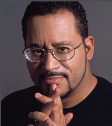
MICHAEL ERIC DYSON, PH.D.

Dr. Michael Eric Dyson is an American Book Award recipient and two-time NAACP Image Award winner. He is one of the nation's most influential and renowned public intellectuals. He has been named one of the 150 most powerful African Americans by Ebony magazine. Dr. Dyson's pioneering scholarship has had a profound effect on American ideas. His books provide some of the most significant commentary on modern social and intellectual thought, interwoven with a combination of cultural criticism, race theory, religion, philosophical reflection, and gender studies. Some of his books provide significant contributions in the area of race and culture, and they include: Making Malcolm X ; I May Not Get There with You ; Come Hell or High Water: Hurricane Katrina and the Color of Disaster ; Debating Race and The Black Presidency: Barack Obama and the Politics of Race in America .