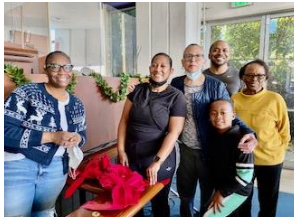
Clockwise from the left: Members of Holman music ministries celebrate the holidays at the parsonage; Advent Task Force members adorn the sanctuary for Christmas services.