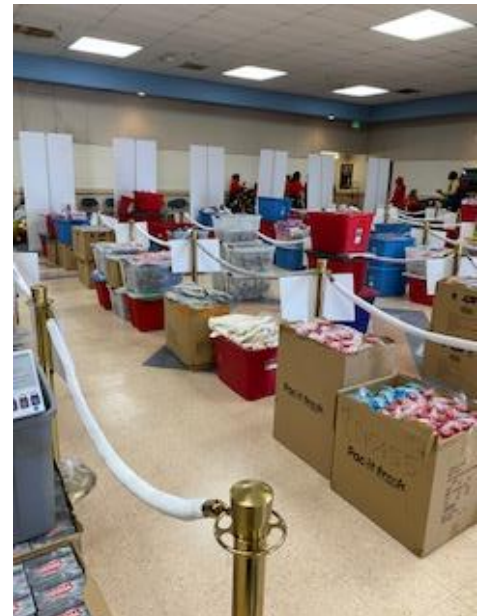
Opposite page: The lines and the smiles stretch from Holman to Arlington Avenue during CYFC's Annual Christmas gift-giving event for foster youth on December 16. This page: CYFC Volunteers pose for the camera. Above: Holman musicians ring in the holidays at the parsonage.